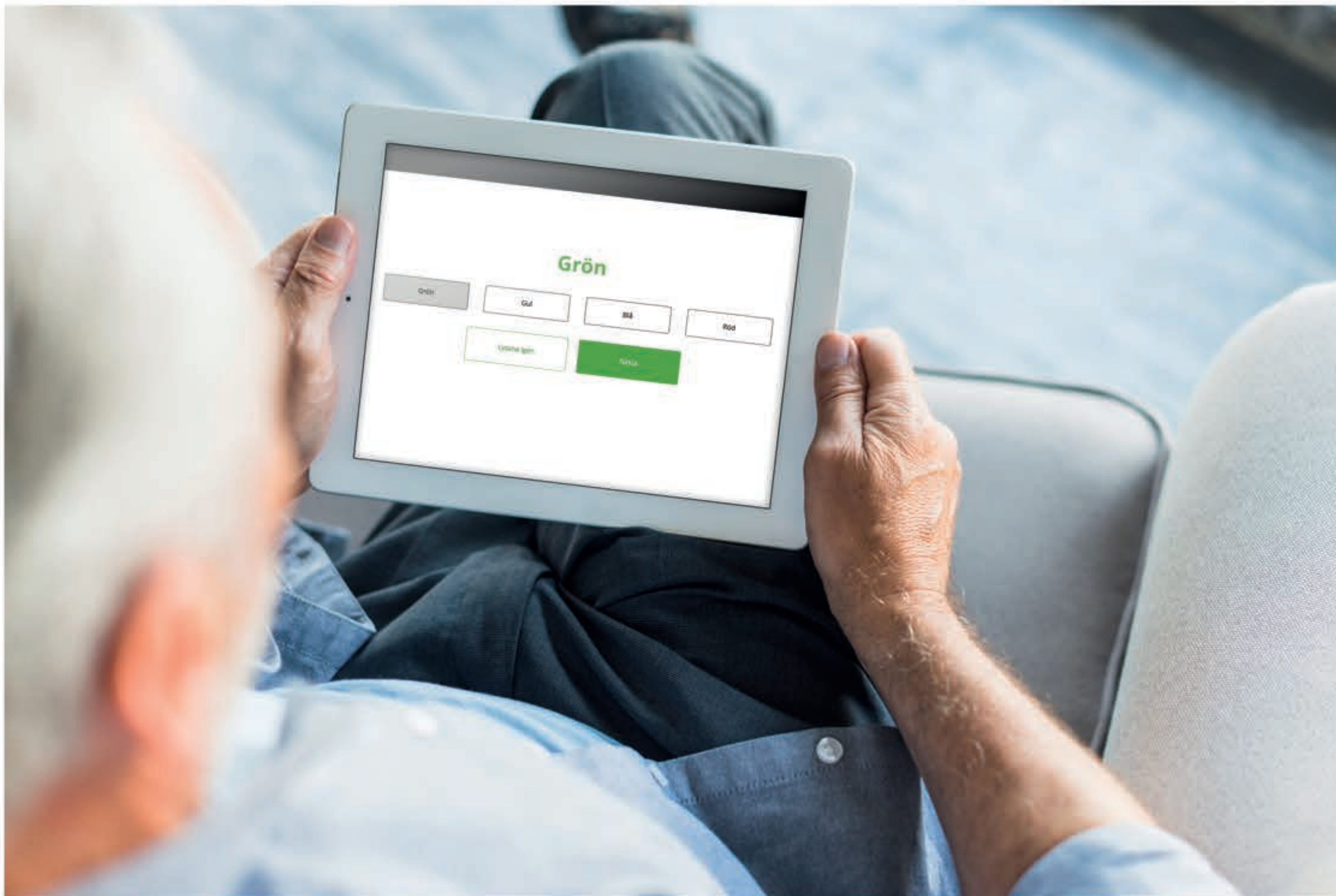
Figure 1: Screenshot of test administration

Cognitive impairment is a key element in most mental disorders. Its objective assessment at initial patient contact in primary care can lead to better adjusted and timely care with personalised treatment and recovery. To enable this, we designed a self-administrative cognitive test battery intended for screening purposes in primary care (Figure 1). The battery includes 22 (sub)tests covering five cognitive domains: attention and processing speed, memory, language, visuospatial functions and executive functions.